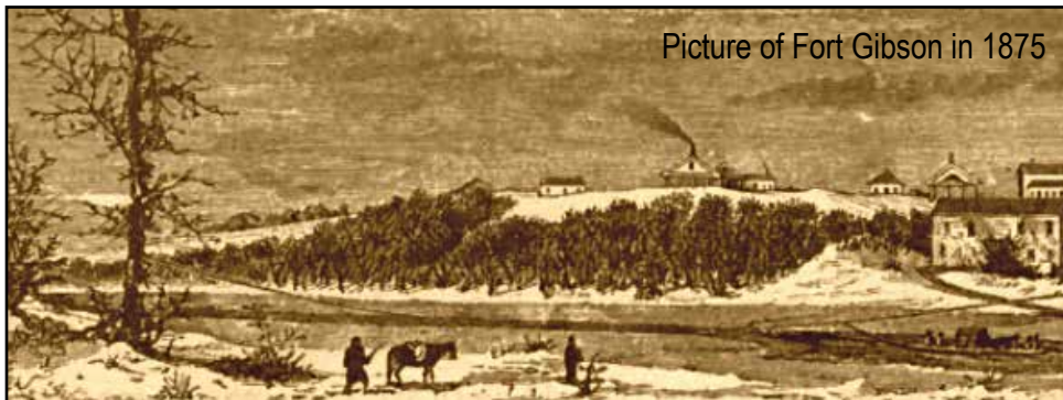
Picture of Fort Gibson in 1875