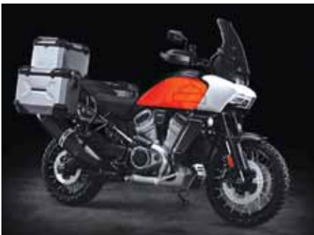
Pan American (looks like a BMW R1200GS)

We will see some new ideas from the MoCo. Mainly in the form of the “Pan American” and the “Bronx” models. Both bikes are powered by a brand new Revolution Max liquid-cooled, 60-degree V-twin engines. The Pan America will arrive with a 1250cc engine, and the Bronx a 975cc engine. Harley-Davidson is known for its 45-degree V-twin, but these two models are built with a 60-degree V-twin.