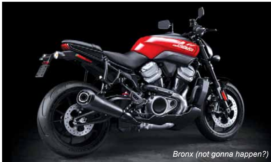
Bronx (not gonna happen?)

LiveWire has a city range of 146 miles and a 0-60 mph time of around 3 to 3.5 seconds. That seems very competitive in the electric bike market. Although Harley-Davidson's first electric model would feature Level 3 DC Fast Charging that would top up the battery from 0-80% in 40 minutes or 0-100% in 60 minutes, which seems to be far ahead of competitors. The issue I see with the "Livewire" is the price of $29,799.